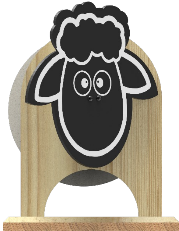
END ELEVATION, LEFT