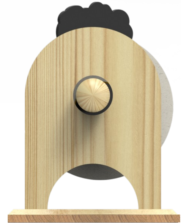
END ELEVATION, RIGHT